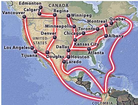
Map of the Mexican drug routes in the United States.