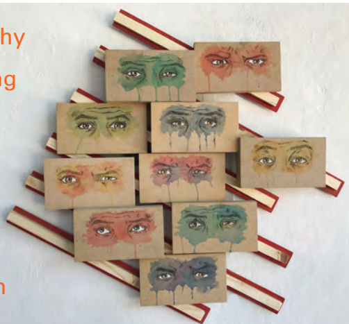
Front: Imperfect Personalities , Trixie S.