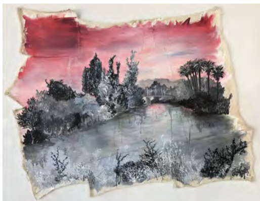
Pieced Together, Sneha A.

We value a balance of commitment to studio practice and play in our program. Each day, campers mix studio time with participation in activities such as inspiration evenings, campfires, yoga, hiking, film screenings, and visits to local art exhibitions. Teens enjoy exploring their independence and making new connections among their peers and mentors.